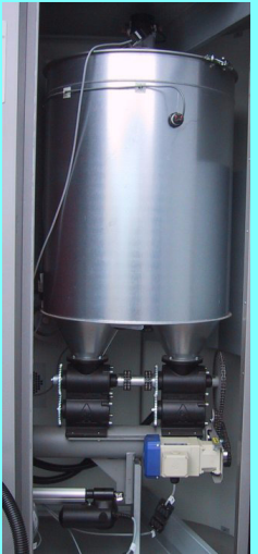
This is our boiler's feeding system: it is quite fiddly because each mouthful is chewed lots and lots