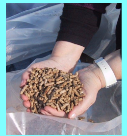
We all love feeding our new boiler (boiler bran)