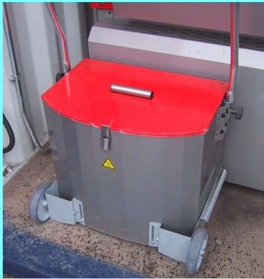
The boiler does not have much waste but here is its portalo

OUR BOILER GIVES US HOT WATER FOR THE POOL