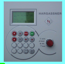
We can talk to our boiler here

This is the larder where our boiler's food is stored