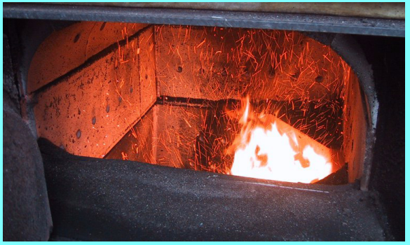
This is our boiler's stomach - Ouch! hot!

Our boiler breathes out here - the CO 2 is absorbed by special trees which are later harvested to provide us with fresh pellets as feed