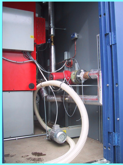
These are our boiler's guts